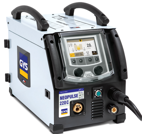
Supplied without accessories