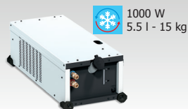
WCU 1kW C 013537