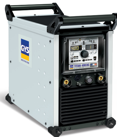
Supplied without accessories