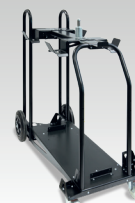
Trolley 10m³ 037328